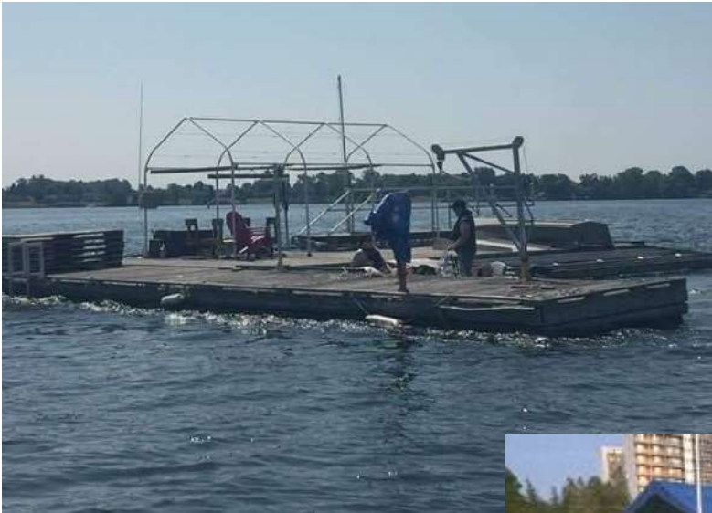
Towing of the Docks